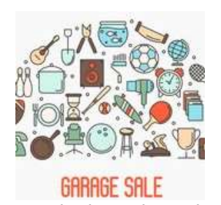
Start looking through your un-needed treasures! (Date TBD - More Info to Follow)