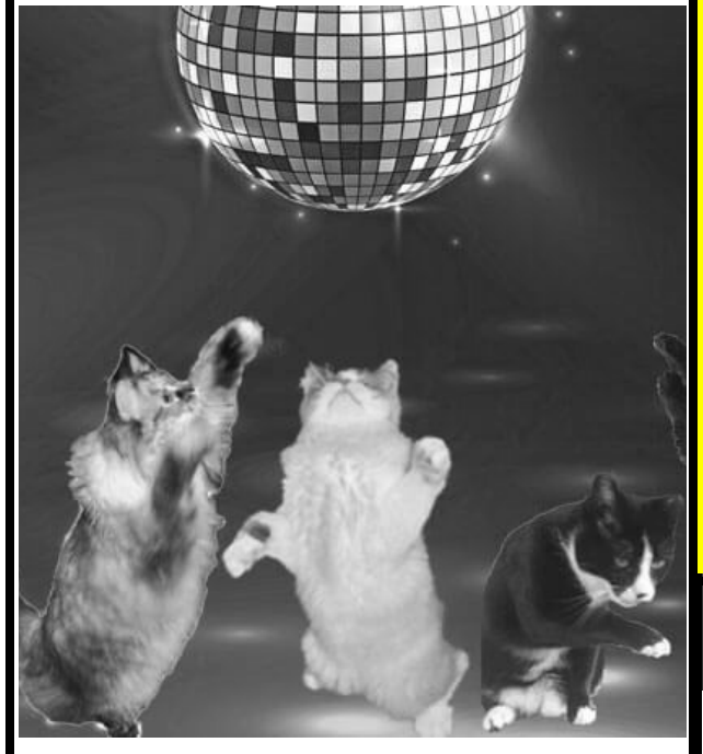
Caturday Night Fever At Cortese's