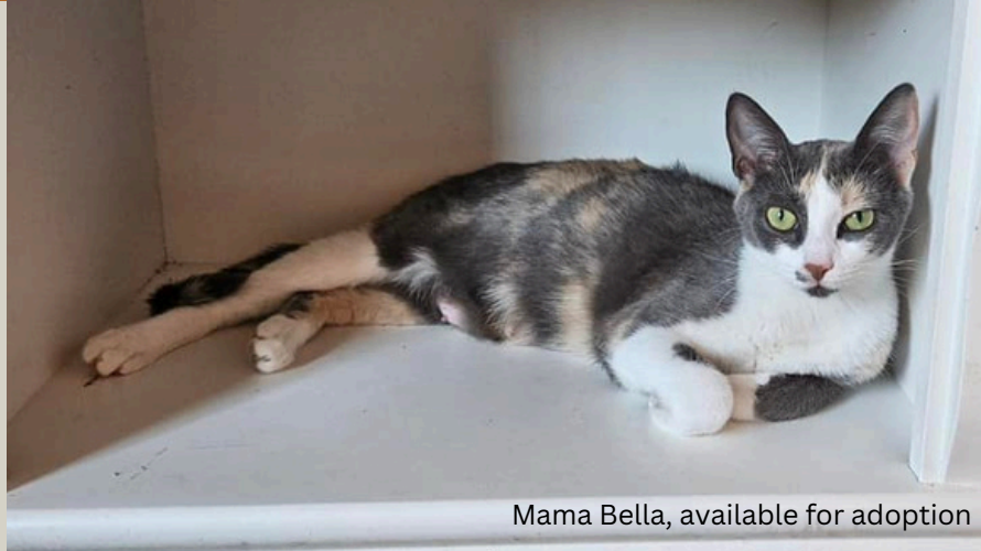
Mama Bella, available for adoption