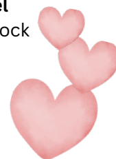
Opal Available for adoption