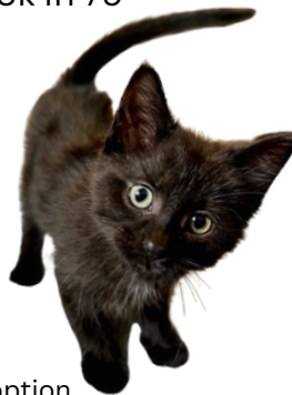
Nebula Available for adoption

So far this year, we've re-homed 146 cats and kittens, and our current foster population is 104.