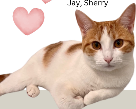
Arabella, Available for adoption