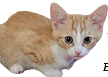
Rafaella Available for adoption