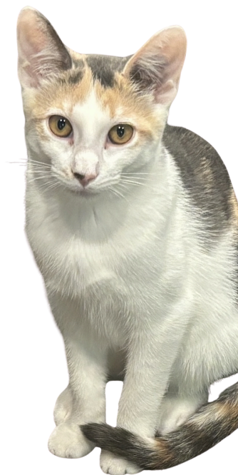
Opal, Available for adoption