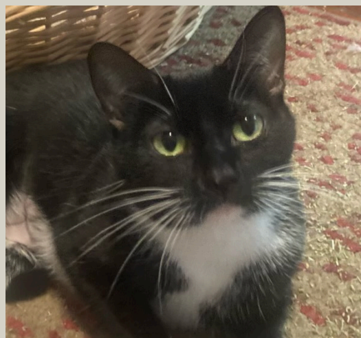
Mama Helen, Available for adoption

Cats also use their whiskers to express emotions. When a cat is curious or excited, their whiskers will usually move forward. When they feel threatened or are in defensive mode, the whiskers will flatten against the face. This subtle body language helps cats communicate with other animals and humans.