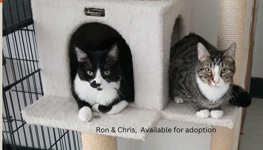
Ron & Chris, Available for adoption