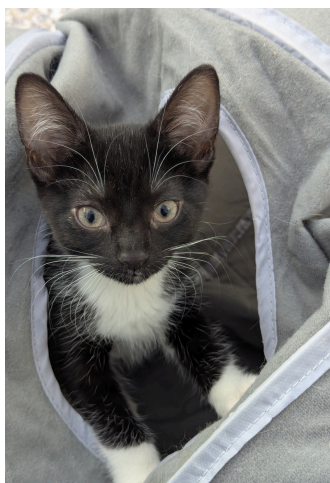
Bridget, Available for adoption

They can sense the vibrations created by small prey, such as rodents or insects, in their vicinity. The whiskers help them determine the direction of movement, enabling cats to strike with precision. In fact, cats often use their whiskers to determine if their prey is within striking distance, ensuring they don't miss their mark.