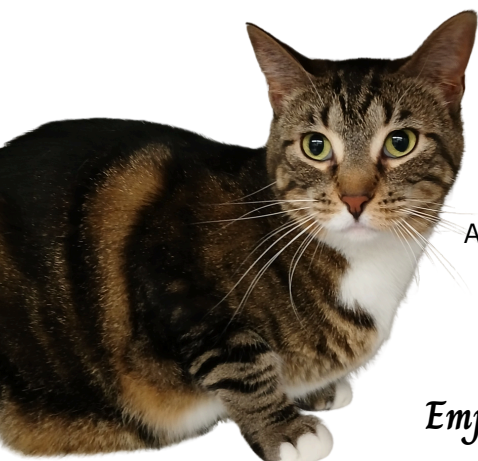
Angelica Available for adoption