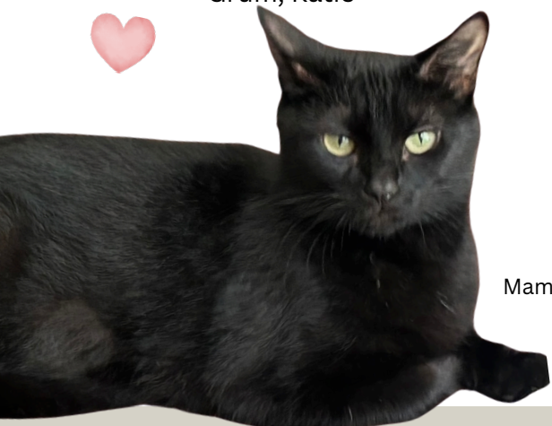
Mama Raja, Available for adoption